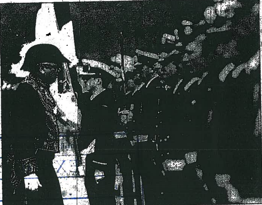
Lucky Lt.-Gov. Steven Point had the 15-gun Vice Regal Salute to keep him awake.

But while all that was not happening, there was the little matter of Campbell's fixed legislative calendar, which legally compels the government to bring in a budget this week, never mind that Campbell's successor will immediately bring in a new one to replace it.