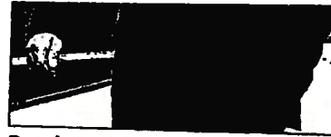
Road-rage killer Brent Parent had 64 previous convictions.